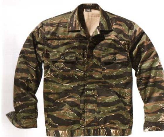
Camouflage Jacket Tiger

Poliester Cotton fabric 65%-35%.Wight 280 g/m 2