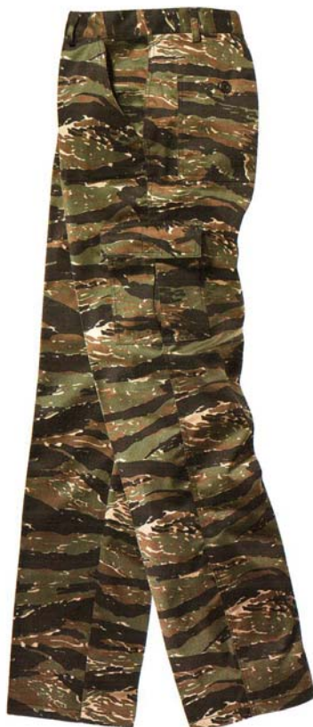
Camouflage Trousers Tiger

Poliester Cotton fabric 65%-35%.Wight 280 g/m 2