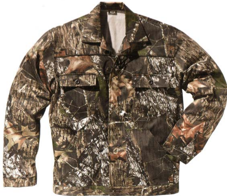
Camouflage Jacket Foresta Poliester Cotton fabric 65%-35%.Wight 280 g/m 2 Button closure. Two breast pockets and lower pockets. Size : S-XXL