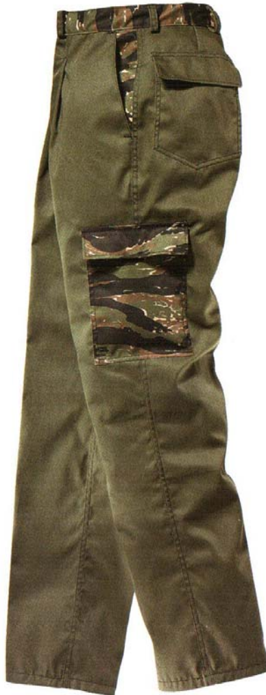
Partly Camouflage Trousers Tiger Poliester Cotton fabric 65%-35%.Wight 280 g/m 2 Button closure, Front pockets, rear pockets and lateral Pockets with flap. Main colour fabric : Green. Size : S-XXL