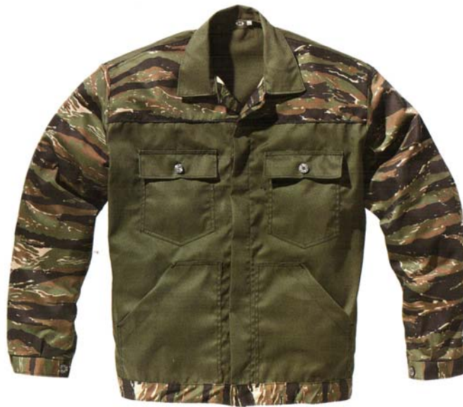
Partly Camouflage Jacket Tiger Poliester Cotton fabric 65%-35%.Wight 280 g/m 2 Button closure, two breast pokets and lower pockets. Main colour fabric : Green. Size : S-XXL