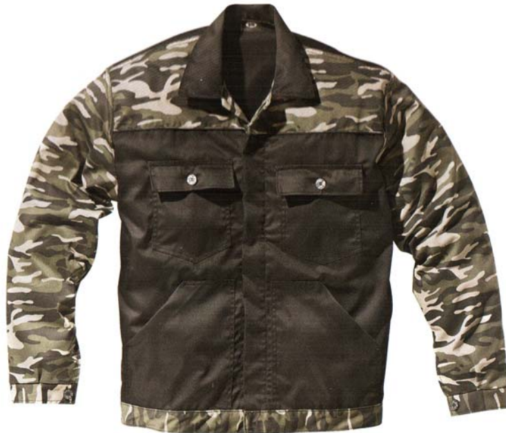
Partly Camouflage Jacket Tundra Poliester Cotton fabric 65%-35%.Wight 280 g/m 2 Button closure, two breast pokets and lower pockets. Main colour fabric : Black. Size : S-XXL