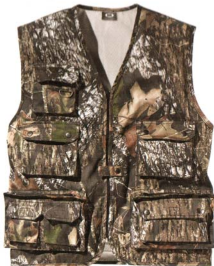
Camouflage Vest Foresta Poliester Cotton fabric 65%-35%.Wight 280 g/m 2 Zip closure. Multi-pocket. Large rear pocket. Size : S-XXL