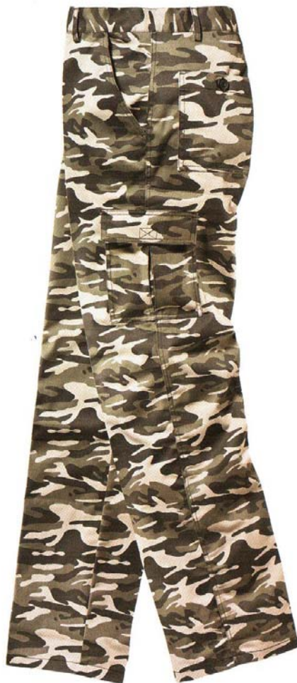
Camouflage Trousers Tundra Poliester Cotton fabric 65%-35%.Wight 280 g/m 2 Button closure, Front pockets, rear pockets and lateral Pockets with flap. Size : S-XXL