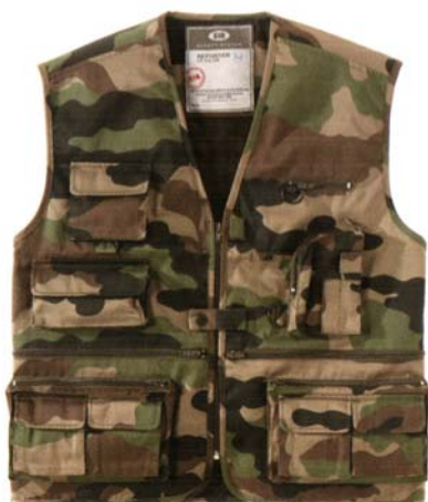
Camouflage Vest Finder Poliester Cotton fabric 65%-35%.Wight 280 g/m 2 Zip closure. Multi-pocket. Large rear pocket. Size : S-XXL