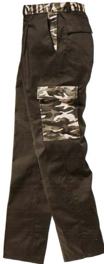
Partly Camouflage Trousers Tundra Poliester Cotton fabric 65%-35%.Wight 280 g/m 2 Button closure, Front pockets, rear pockets and lateral Pockets with flap. Main colour fabric : Black. Size : S-XXL