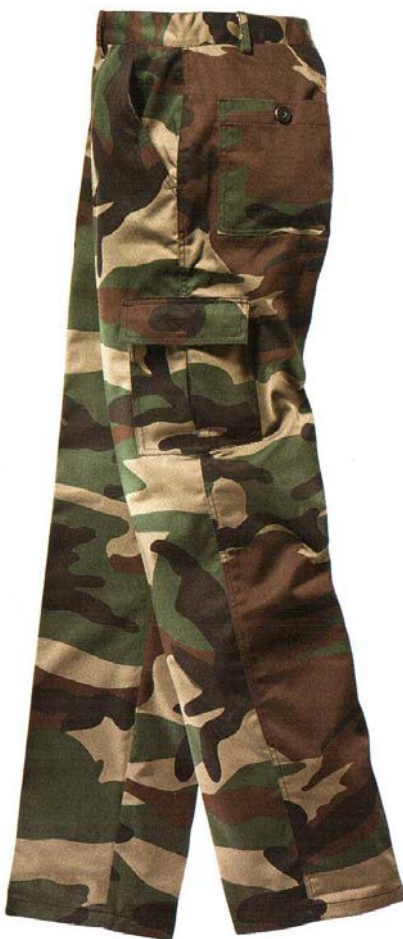
Camouflage Trousers Finder Poliester Cotton fabric 65%-35%.Wight 280 g/m 2 Button closure. Front pockets, rear pockets and lateral Pockets with flap. Size : S-XXL