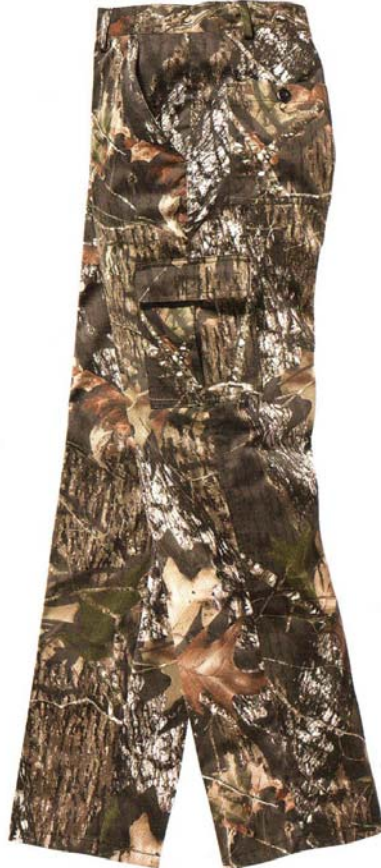
Camouflage Trousers Foresta Poliester Cotton fabric 65%-35%.Wight 280 g/m 2 Button closure, Front pockets, rear pockets and lateral Pockets with flap. Size : S-XXL